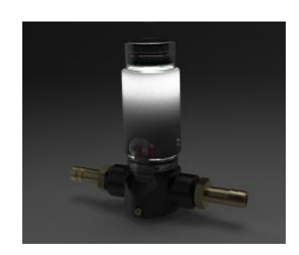
Accessory: Diode Light-Lamp