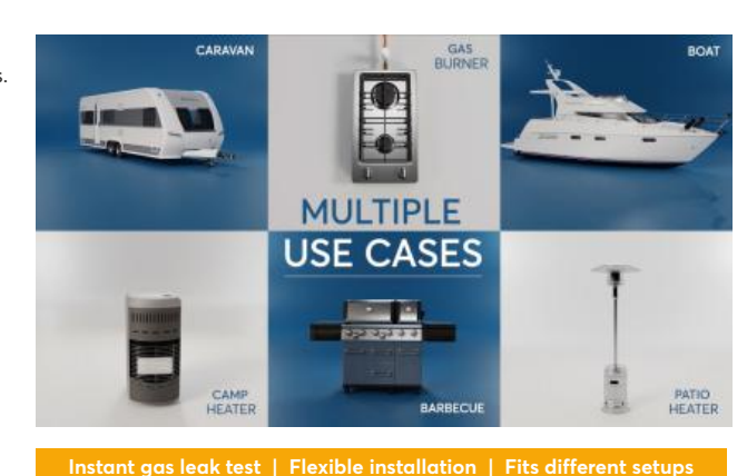
Caravans | Gas Burner | Boat | Camp Heater | Barbecue | Patio Heater

Data source for Europe & developing countries: IGT estimation based on empiric observations