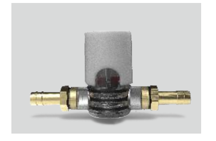
GazOkay® Test Mode