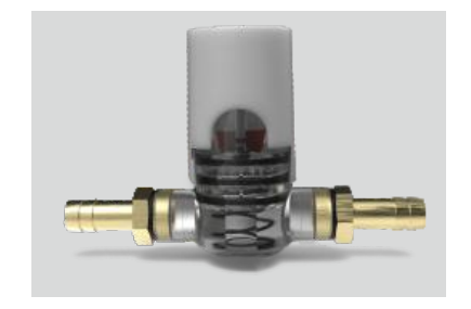
GazOkay® Standby Mode