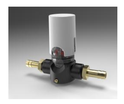
GazOkay®With Aluminum Wall-Table Bracket